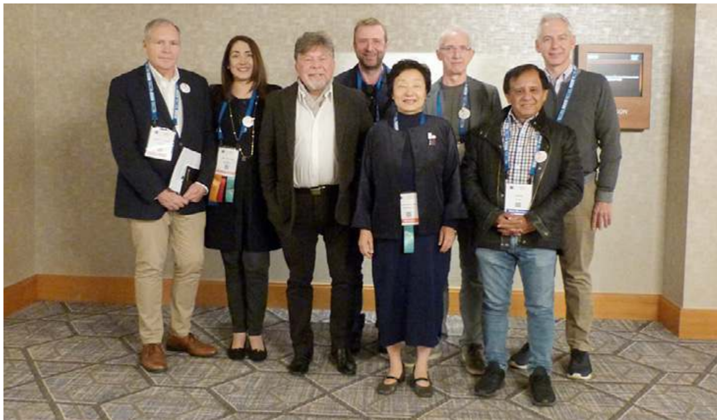
Last World Congress Committee in Washington, November 2018